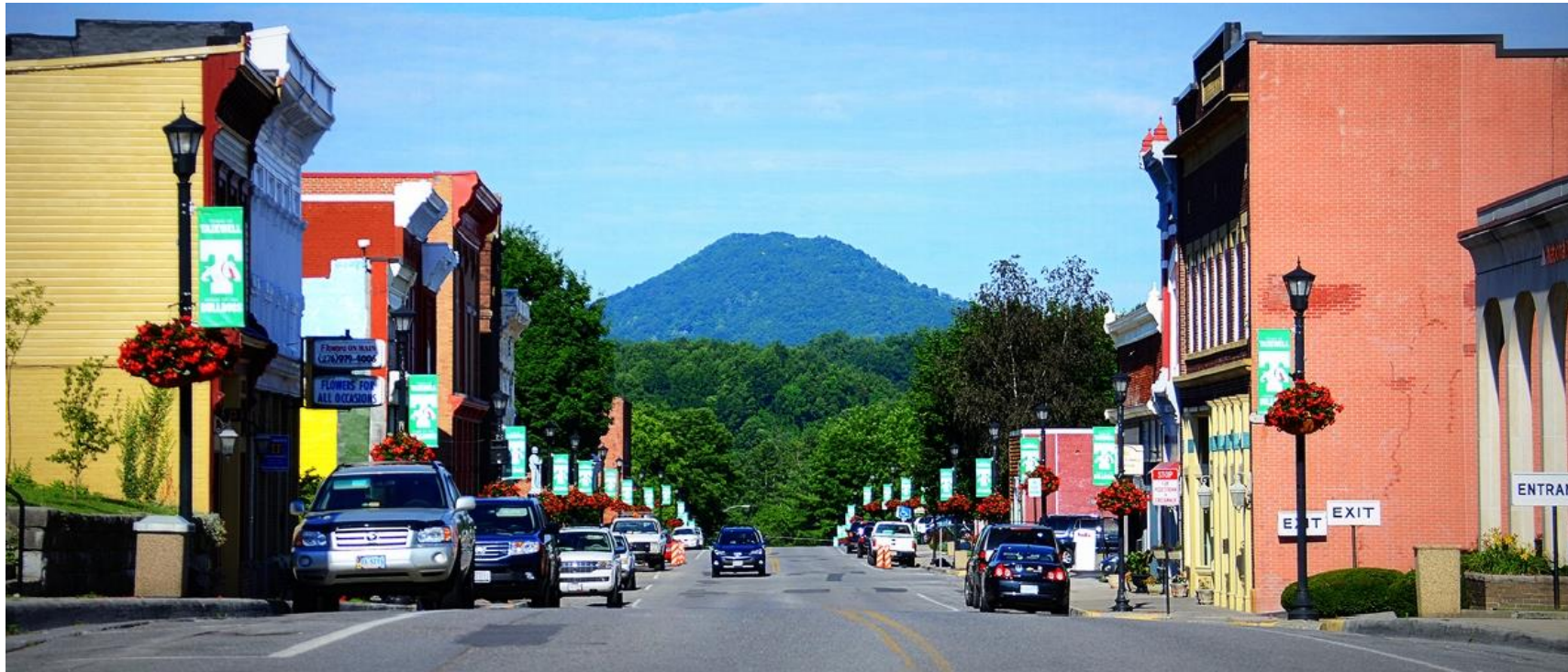
Main Street Tazewell, May & May Law Offices were on this street.