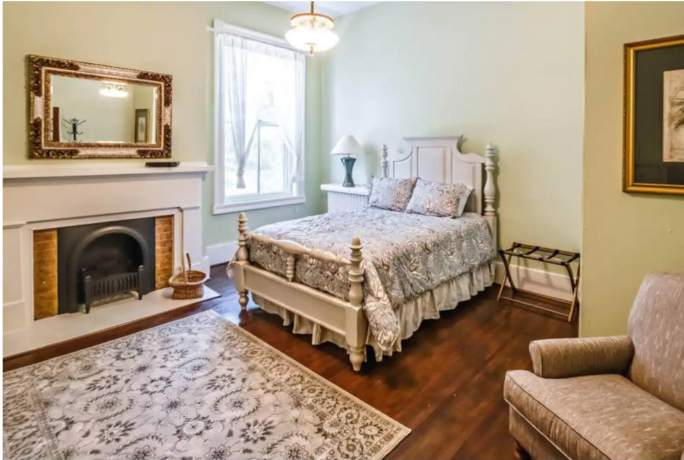
Room #7 - The Nelle May Room (Upstairs)