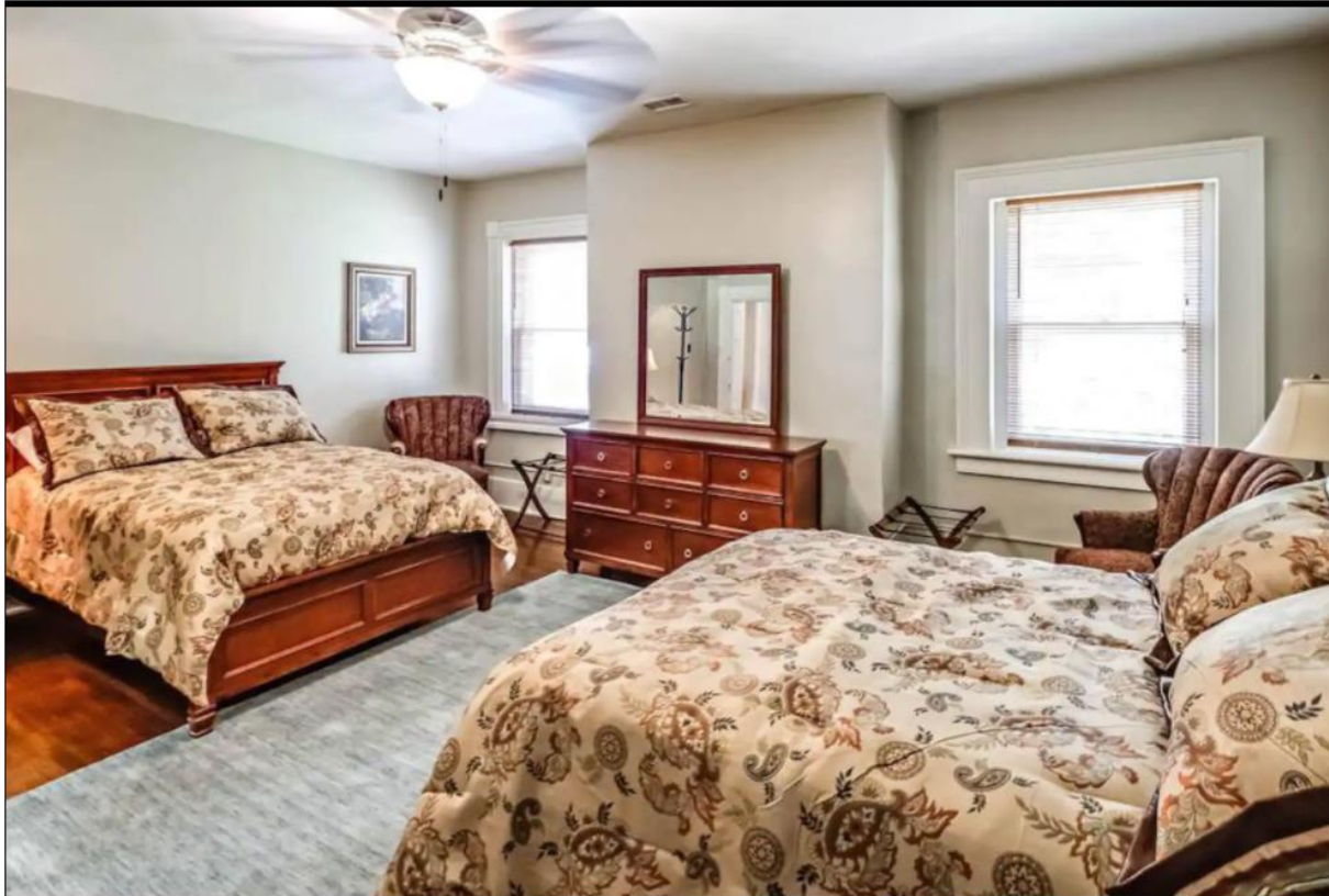
Room #5 - The Mary May Room (Landing)