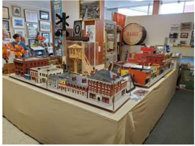
Ann & docent at Carnegie Historical Society looking scale model of Carnegie streets in late 19th century