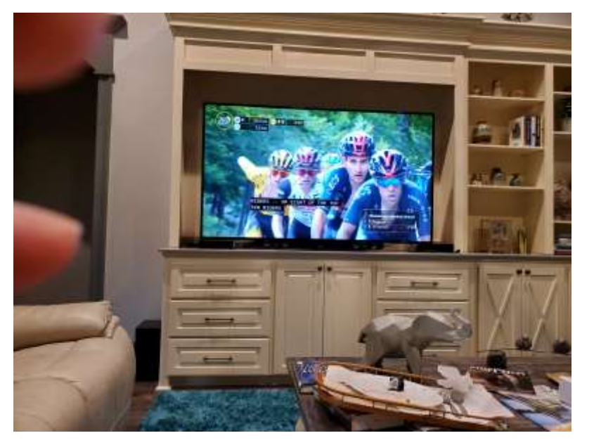
Watching the 2021 Tour de France