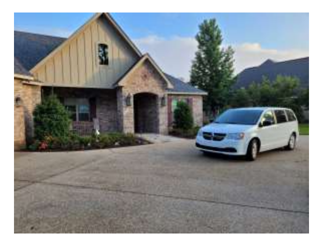
Leaving "hot" Mississippi for "cool" Virginia In July