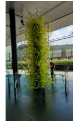
Scenes from the Corning Museum of Glass: Clockwise: Entrance, Glass Christmas Tree, Fall (lots of glass pumpkins, 50th anniversary of Corelle Ware (display of shapes & patterns). Ann in front of a solar chandelier.