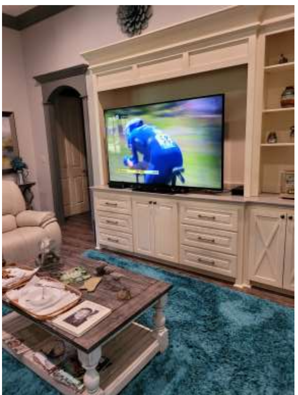
Magnificant bike racing & views of The French Countryside