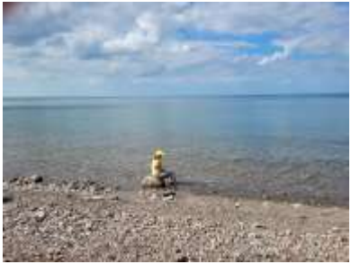
Colin's wife, Gaye by Lake Ontario