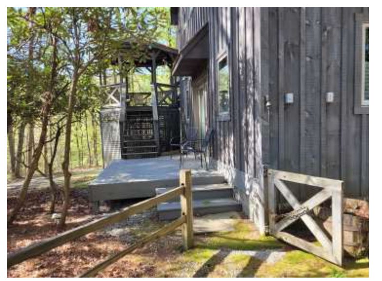
Gate is open for our arrival & Welcome Sign: "Cabin Sweet Cabin"