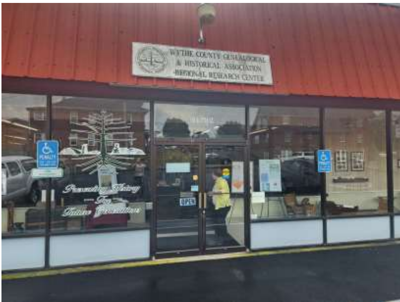
Our New Volunteer Spot: WCGHA in Wytheville