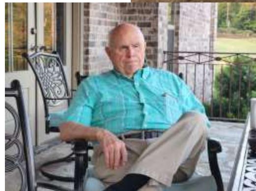
Breakfast and Conversations Between "Old Salts"