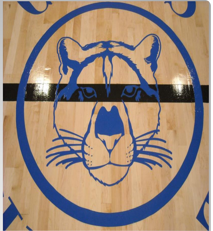
Ceres Wildcats LOGO