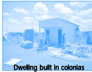
Dwelling built in colonias