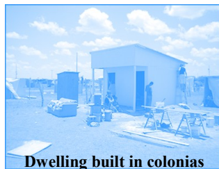
Dwelling built in colonias